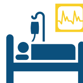
TERMINAL ILLNESS BENEFIT