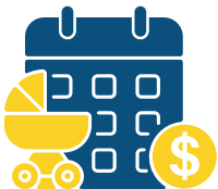
MATERNITY BENEFITS – 105 DAYS OF PAID LEAVE