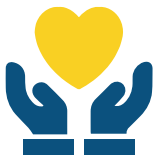
DCX CARES PROGRAM