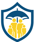
GROUP LIFE INSURANCE