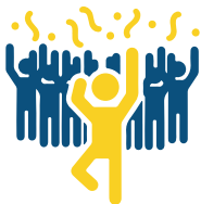
TWICE-YEARLY COMPANY PARTIES