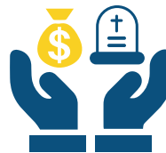
BENEVOLENCE FUND / EMPLOYEE ASSISTANCE PROGRAM