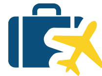
TRIPS TO THE PHILIPPINES FOR OUR PARTNERS!