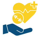
HEALTH & WELLNESS PROGRAM