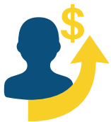
GUARANTEED ANNUAL RAISE