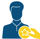
MONTHLY EMPLOYEE APPRECIATION HOURS