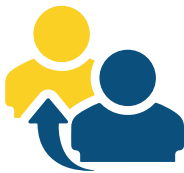
EMPLOYEE REFERRAL FEE – $125