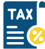
MANDATORY PH PAYROLL TAXES