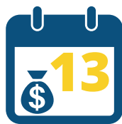
BUILT-IN BONUS – 13TH MONTH PAY (DCX PROVIDED)