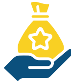
REWARDS PLATFORM FOR PARTNERS TO GIVE BONUSES