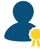
DCX-CELLENCE AWARDS, EMPLOYEE COMMENDATIONS & RECOGNITIONS