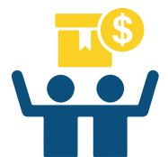
QUARTERLY DCX BUSINESS PERFORMANCE BONUS