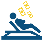
GENEROUS PTO – 1 DAY FOR EVERY MONTH ACCRUED & CONVERSION TO CASH FOR UNUSED DAYS