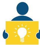
WEEKLY INSPIRATION POSTS, COMPETITIONS & MORE