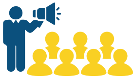
QUARTERLY TOWN HALLS