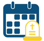
BEREAVEMENT ASSISTANCE & LEAVE