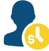
SERVICE LEAVE INCENTIVE – 5 DAYS AFTER 1 YEAR OF SERVICE