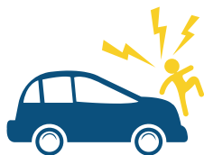
ACCIDENTAL DEATH/DISABILITY INSURANCE