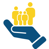
FAMILY ASSISTANCE BENEFIT