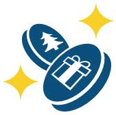
ANNUAL CHRISTMAS GIFT