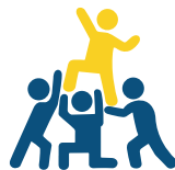
TEAM BUILDING ACTIVITIES