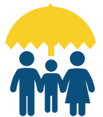
HEALTH BENEFITS PACKAGE – SOCIAL SECURITY, GOVERNMENT-BACKED HEALTHCARE, HOME DEVELOPMENT MUTUAL FUND, HMO PLAN FOR REGULAR EMPLOYEES